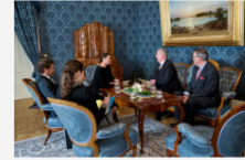
The Ambassador of the Sovereign Order of Malta to Hungary presents his letters of credence