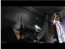
The Order of Malta's Holy Family Hospital in Bethlehem: a birthplace of hope