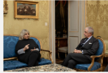
The President of the International Institute for the Unification of Private Law at the Magistral Palace