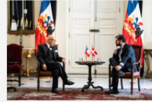
The Ambassador of the Sovereign Order of Malta to Chile presents his letters of credence