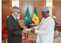
The Ambassador of the Sovereign Order of Malta to Senegal presents his letters of credence